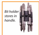
Bit holder stores in handle.